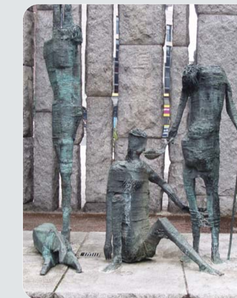
Cuimhneachán an Ghorta