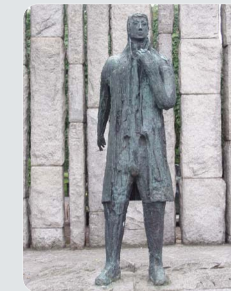
Theodore Wolfe Tone (1763 - 1798)

By Edward Delaney of a sculpture group which symbolises the unhappy subjugation of the Irish people.