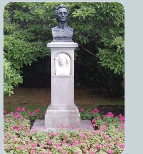
James Clarence Mangan (1803-1849)

Irish poet and Nobel prize winner in 1923 for literature. Bronze statue by Henry Moore entitled 'Yeats' erected in 1967.