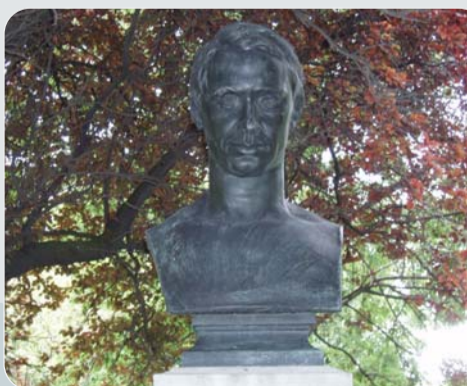
Thomas M. Kettle (1880-1916)

A seat placed in the park in 1958 to commemorate both women who worked for women's rights, social justice and world peace.