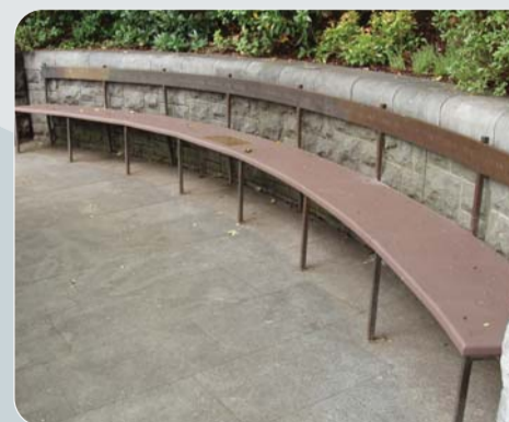
Louie Bennett and Helen Chenevix