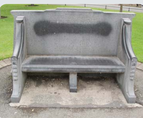
Haslam Memorial Seat