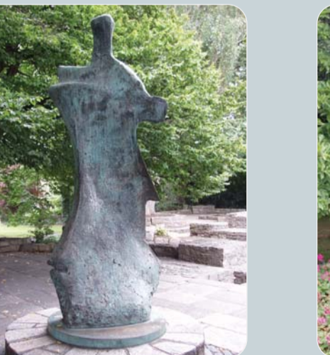
William Butler Yeats (1865-1939)

Erected in 1968 on the golden jubilee of the 1916 rising in honour of former members of Fianna Éireann.