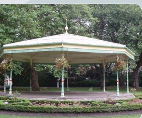
Ardán Bannaí Ceoil