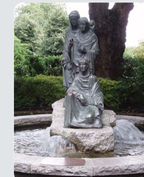
Triúr Bandéithe na Cinniúna