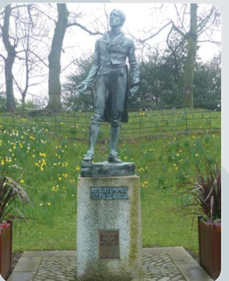
Robert Emmet (1778-1803)