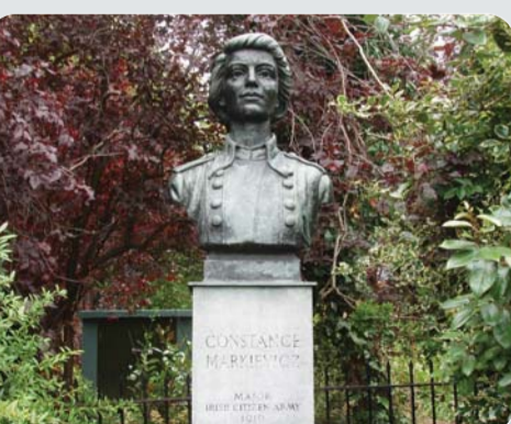
Countess Markiewicz (1868-1927)

A Quaker couple who were pioneers of Irish feminism. A finely sculptured seat of Kilbenny limestone erected in 1925.