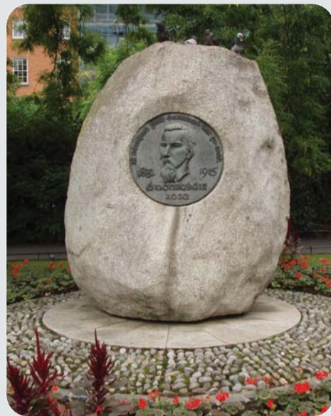
Diarmuid Ó Donnabháin Rosa 1831-1915

A Roman triumphal arch of grey Wicklow granite with limestone inscription panels of limestone. Opened in 1807 to commemorate the Officers and men of the Royal Dublin Fusiliers who died during the Boer war 1899-1900.